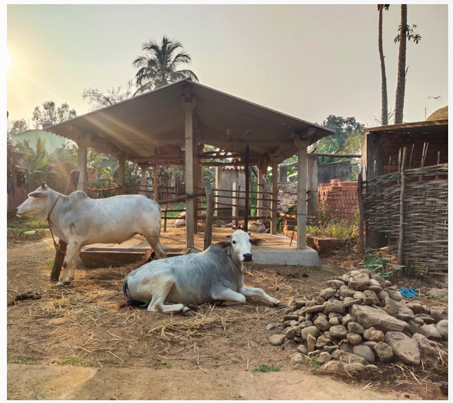
Residents of Bantabori sahi also owned cattle which formed an additional source of income

Upper castes from the village found themselves in strong class position. With sizeable land holdings, they were able to secure credit to buy trucks for coal transportation, while this helped them generate more income, on mine closure, they suffered huge losses. However, by selling off more land, they were able to pay off their debts. Similarly, having land gave them an upper hand economically and most families of Bantabori sahi owned cattle which formed another source of income for them. It is evident how land helped the upper castes in accumulating revenue as well as shielding themselves from mine closure. This privilege in unavailable to the lower castes in the village who barely earn enough for daily food requirements. With no savings and alternative livelihood options, SCs in the village become the most vulnerable community.