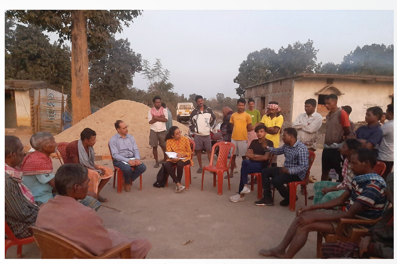
TERI team having a discussion with the tribal residents of Orampada village of Sundargarh, Odisha

We don't want to see an energy transition divide and we don't want to leave any community, individual or region behind. To do this ADB launched a Just Transition support platform at COP27 at Sharm-el-Sheikh. ADB like many other MDBs has signed on to a just transition high level principles to articulate what we see as a common understanding of just transition and to guide our operations.