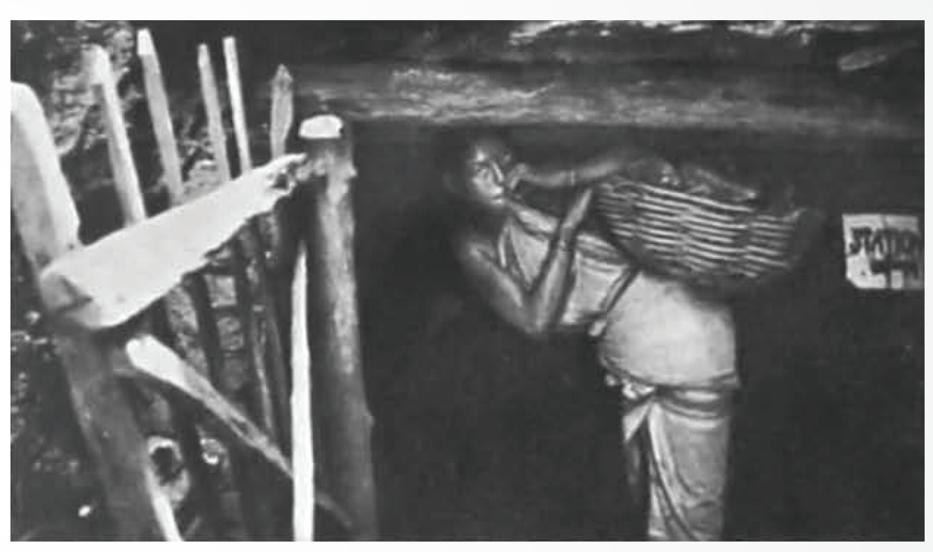
A woman emerging from an incline.

Today's discourse on a just transition away from fossil fuels to cleaner energy is shaped by the broader consensus around climate change mitigation and the need to achieve net zero carbon emissions in order to avoid the catastrophic effects of global warming. If one is to understand the concept of just transition as a primarily labour and employment issue aiming at fair and equitable outcomes for all concerned parties especially those more socio-economically vulnerable - there was a time in the dawn of the scientific-technical era of the world where there was an "unjust" transition. This was the gradual exclusion of women from mining activities in the context of increased industrialisation and mechanisation