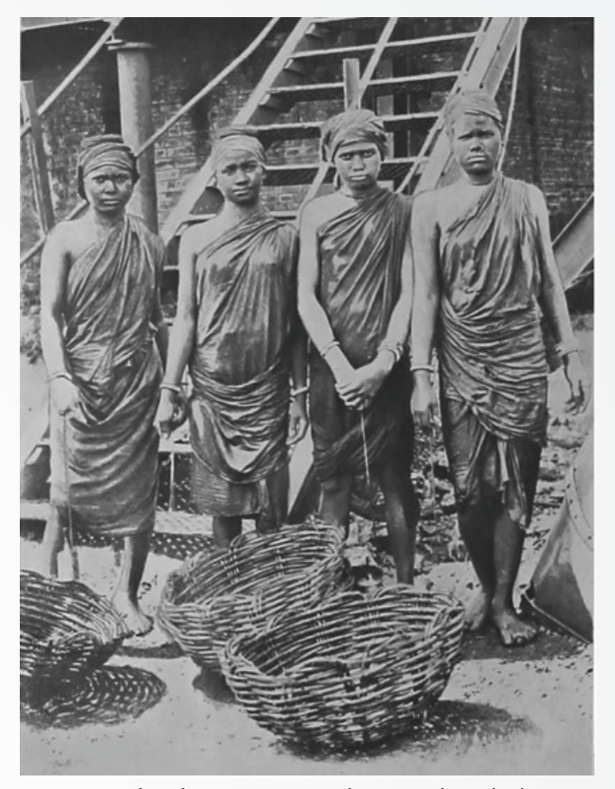
Women workers leaving a wet coal mine with soaked garments clinging to the skin. Source: Annual Report of Chief Inspector of Mines in India, 1927

By the 1920s, however, there was a shift away from open cast mining to shaft or pit-mining and because of high capital investments this led to preference for a more stable and skilled workforce among colliery owners (ibid.). This ruled out the adivasis for whom commitment to land as farmers trumped their work in the coal mines (ibid.). Coal mine companies started engaging contractors who brought in labour from