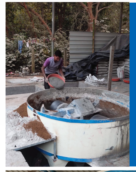
STEP 1: 2:1:(.25) IS THE PROPORTION OF FLY ASH: SAND : CEMENT THAT IS MIXED TOGETHER IN A CHURNER