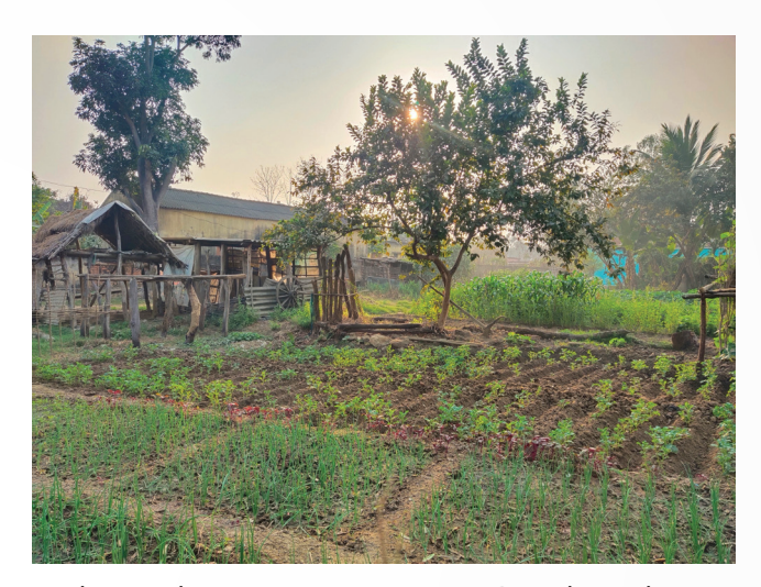
Kitchen gardens were a common site in Bantabori sahi, Chhendiapda village

especially compared to OBCs and those belonging to 'Other' castes have a higher access to land in comparison to their share in population, 48% and 29% respectively. Further, OBCs make up 46% of the total agricultural households whereas SC and ST households accounted for 16% and 14% respectively. The data, however excludes agricultural labourers who would have given a more real picture of marginalisation in the country. Similar trends were observed in Chendipada village. SCs in the village owned the least amount of land and worked mostly as agricultural labourers, whereas OBC and general castes owned commercially viable land holdings. After the closure of Chhendipada OC mine in 2014 that left the local population unemployed, they returned to farming.