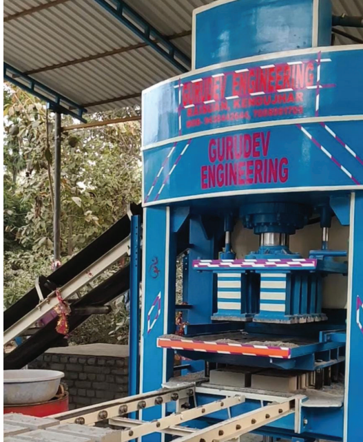
STEP 3: THE MOULDS IN THE MACHINE CAST THEM INTO FLY ASH BRICKS. IN ONE ROUND 15 SUCH BRICKS ARE MADE