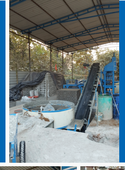
STEP 2: ONCE MIXED, THE CHURNER IS STOPPED AND THE MIXTURE GOES UP INTO THE MACHINE THROUGH THE BELT