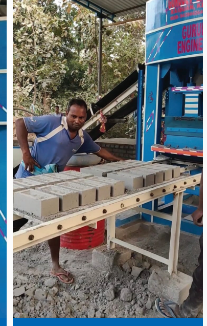
STEP 4: THESE BRICKS ARE THEN MANUALLY CARRIED TO BE DRIED IN THE SUN