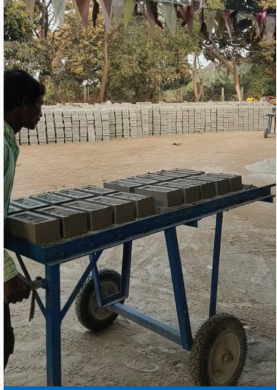
STEP 5: IN 5MIN 15 BRICKS ARE PRODUCED WHICH ARE SOLD FOR RS.3-3.5 EACH. THE LABOURERS ARE PAID RS.500/DAY, MUCH HIGHER THAN THE RS.300/DAY THEY EARN IN COAL MINES